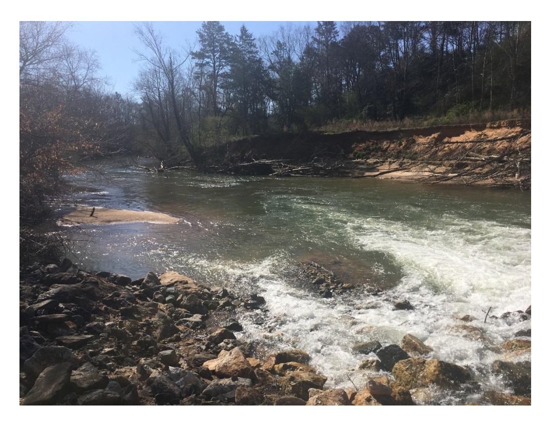
Bank Erosion Downstream of Weir