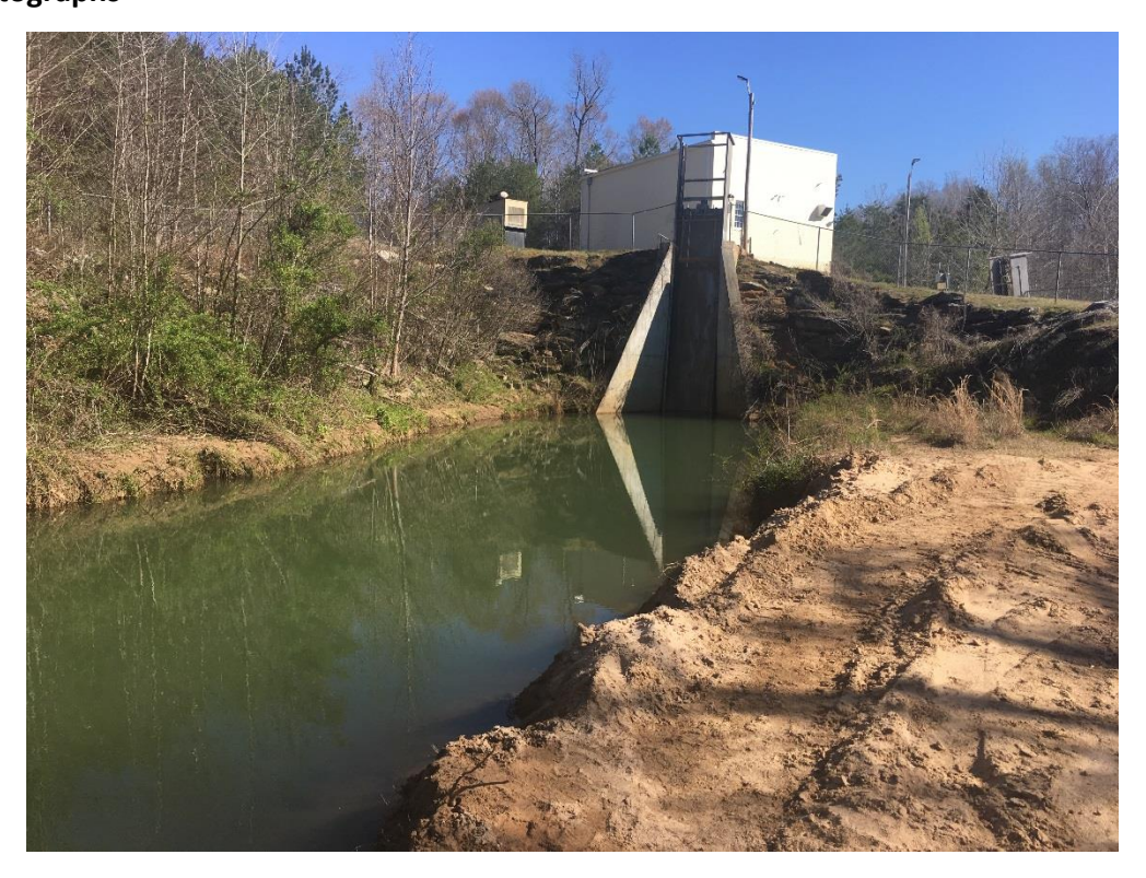
First Broad River Intake and Raw Water Pump Station