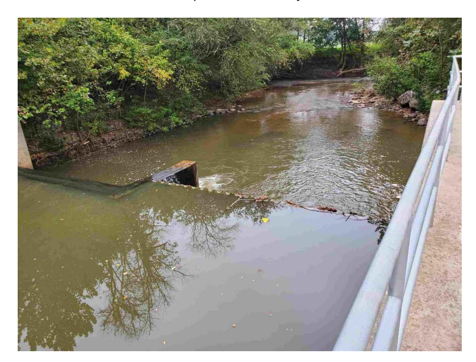
Example of Similar Project