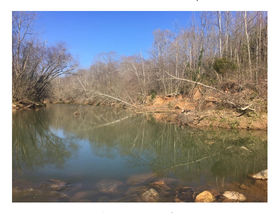
Bank Erosion Upstream of Weir